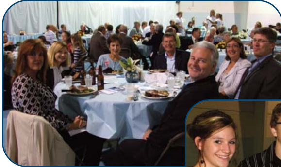
Guests of Hope in a Hangar 2009

We are very excited that so many of our volunteer pilots have agreed to help with pilot and mission outreach through our Aid Kit program. Their efforts have been tremendous. On May 1st, LifeLine Pilots will once again be hosting Hope in a Hangar at Byerly Aviation. Inspired by the positive feedback from the 2009 event, we are working even harder to make the evening fun and entertaining. We hope those who attended last year will join us again and bring along more new faces with whom to share LifeLine Pilots' mission. As always, thank you for your continued support of LifeLine Pilots!